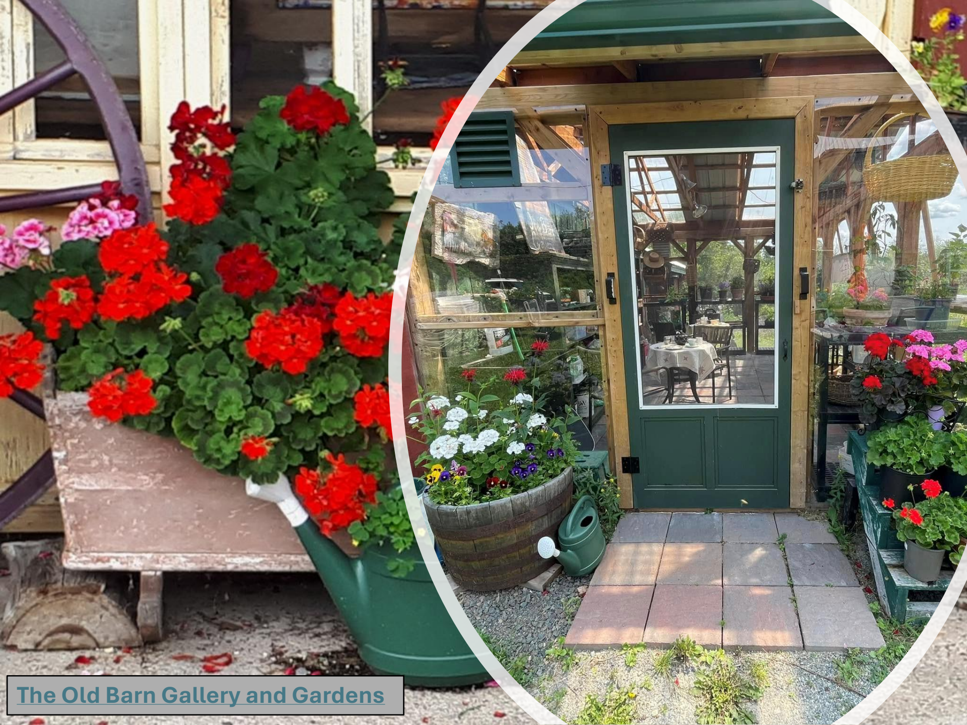
The Old Barn Gallery and Gardens