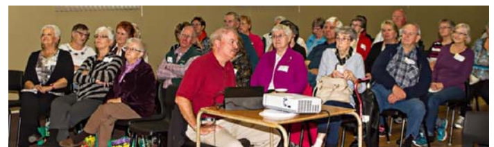
Guest Speaker Stephen King