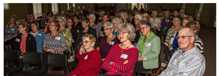
Excellent attendance, enjoyed by all