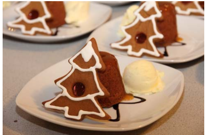
A beautiful and crative dessert