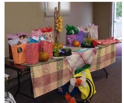
Many great draw prizes