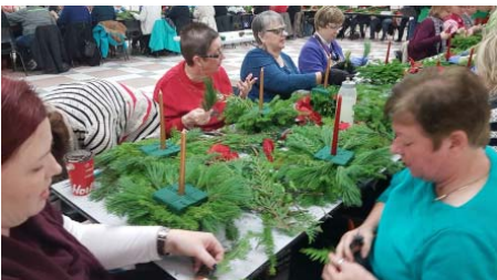
Community Members enjoying the challenge of creating Christmas decorations