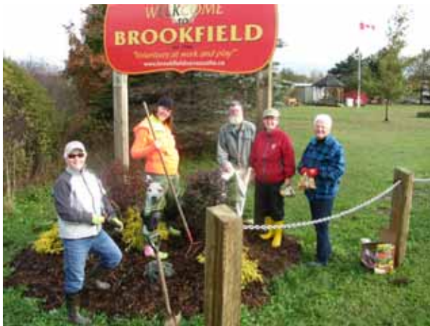
Bulb Planting Crew

Brookfield Garden Club is for the third year decorating our community with Christmas wreaths. Wreaths are sponsored by local folks, which include businesses, clubs and families. The wreaths hang from locally made brackets with plaques on utility poles along the main streets of the village. The work of attaching the wreaths to the brackets is done by members and family. Our community has shown great support!