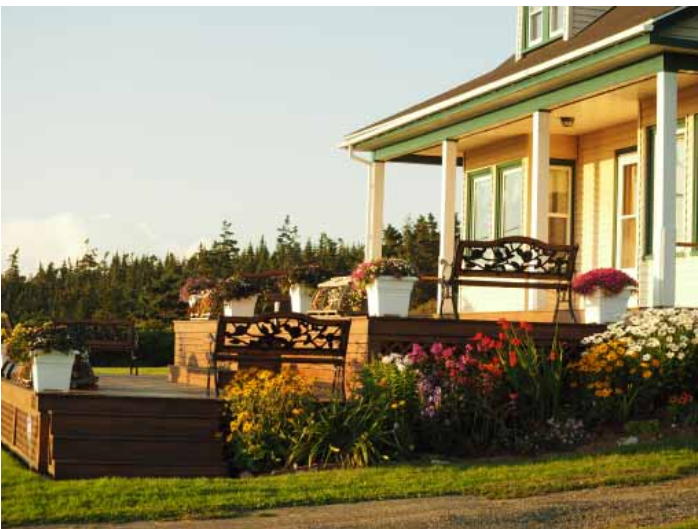
Garden of Penny Payalma