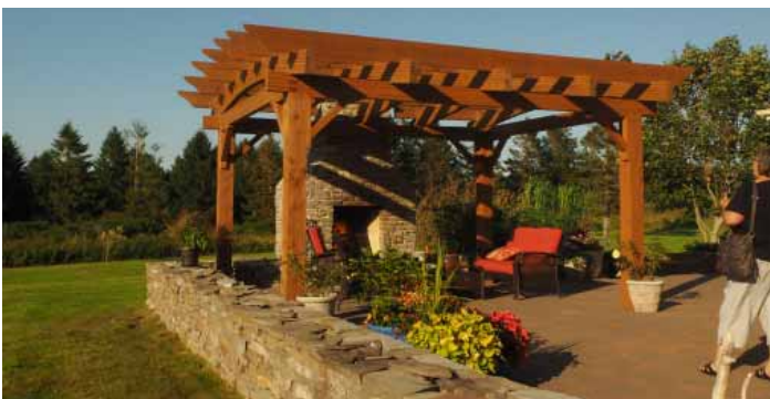
End of summer Potluck in the garden pf Randy & Kelly Pippy