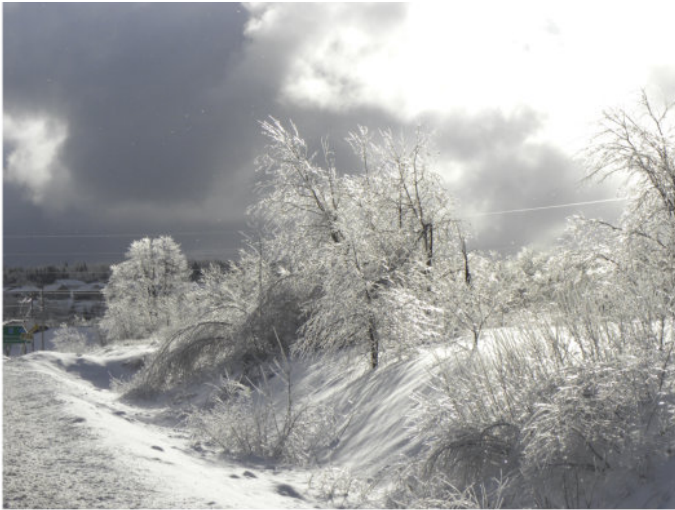
Freezing Rain Aftermath 07 2013 Dec 25 by Jeannie Gibson Collins of the Valley Garden Club.

Jeannie's photograph is a reminder that even when your garden is slumbering under ice and snow that there is still beauty to be captured. Put away your garden tools but do not put away your camera.