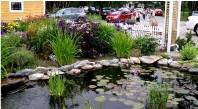
Garden of Kathy d'Entremont