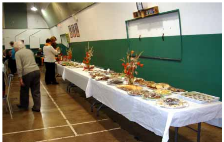
Always great food at a Central District Meeting