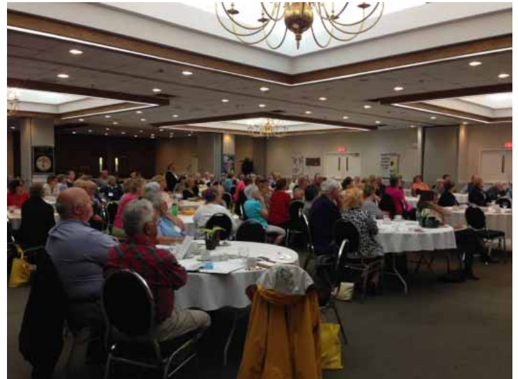
Gardeners from clubs across the province attended the annual Nova Scotia Association of Garden Club convention held at the Rodd Grand Hotel on June 5/6.