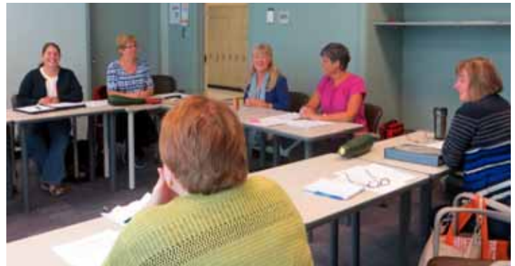
September meeting of the Board, NSAGC